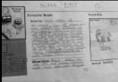
M.Vaishnavi (Telugu) A.V.Model School, Telangana (Category 1 – 4)