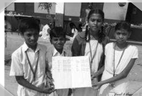
Govt. Model Girls Higher Primary School Sarjapur, Bengaluru (Category 5 – 7)