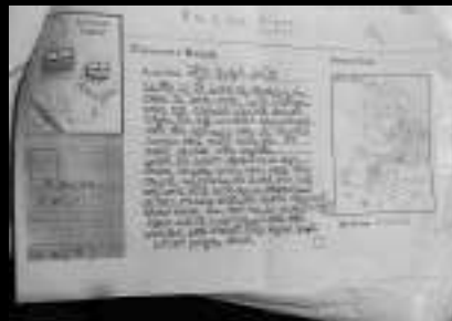
T Srishia (Telugu) ZPHS Thumkunta , Hyderabad (Category 8 – 10)