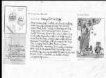
Akash Ahirwar SSGM Indirapuram, U.P, (Category 1 – 4)