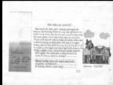
Zoya Haider Sophiya Public School, Ghaziabad ,U.P (Category 5 – 7)