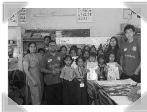
MPPS Siddiqnagar, Hyderabad (Category 1 – 4)