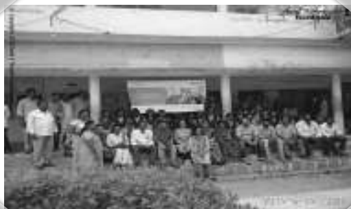
ZPHS Rudraram, Hyderabad (Category 8 – 10)