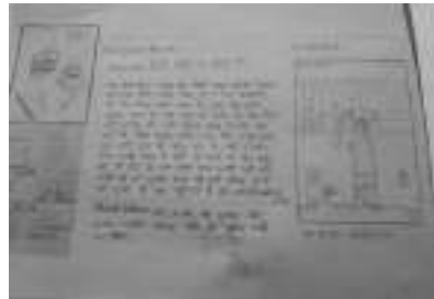
Savita SOS Children Village, Hararyana (Category 8 – 10)